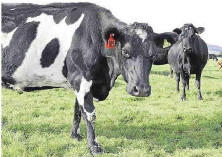
The Englishes milk about 870 Friesian-cross cows on their 335-hectare milking platform.